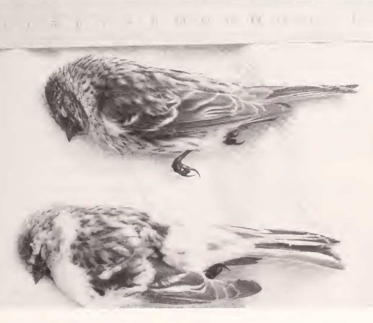
Fig. 24. Territorial male redpolls collected within 100 m of each other at the mouth of the Salmon River (Platinum); June 1974. Subsequent electrophoretic analysis of feather proteins indicated they were Carduelis flammea ( top ) and C. flammea × hornemanni .

Hoary redpolls and intermediates (DNW photos) were in nesting territories (9–350 m asl) either in low-to-tall riparian shrub sheltered by cutbanks or at the upper edge of subalpine low shrub habitats. At Chagvan Bay, two freshly built nests were found on 24 May and another on 26 May, and one egg was in one nest on 26 May 1987 (D. F. Parmelee and J. M.